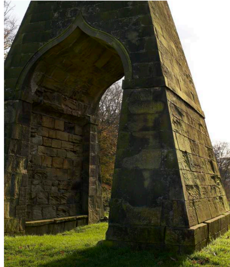
LANDSCAPE The Park owned by the Fitzwilliam Wentworth Amenity Trust includes several spectacular monuments which are already regularly open to the public